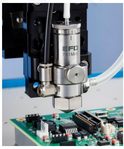
Zero overspray prevents part contamination.

The 781Mini<sup>™</sup> precision Low Volume, Low Pressure (LVLP) spray valve features a patent-pending design that directs nozzle air pressure more consistently, for a more uniform spray pattern. This delivers greater accuracy and edge definition in applications of low-to-medium viscosity fluids such as activators, coatings, greases, oils, inks, liquid fluxes, silicones, and solvents.